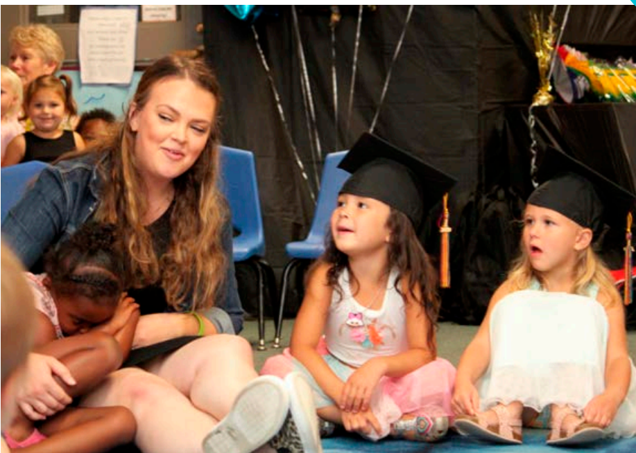
~ A mother from our Family Resource Center parenting class

“18 Degrees helped me get my kids back.”