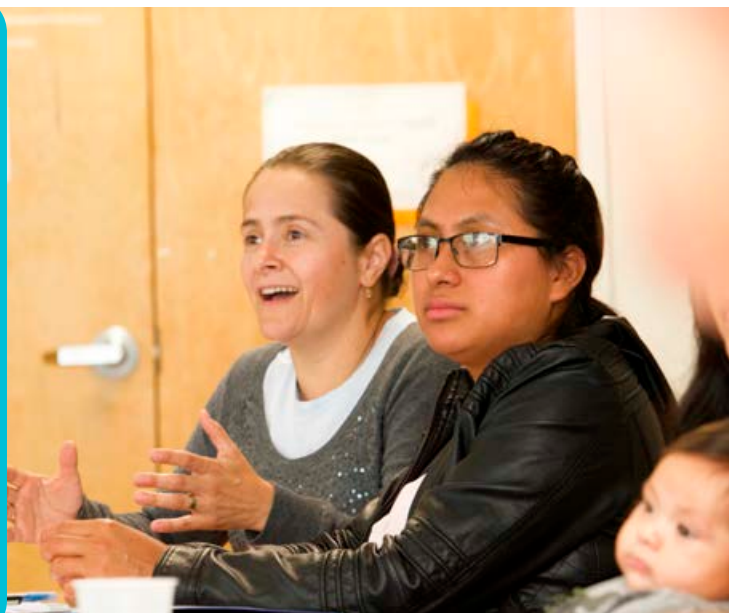
~ A participant in EMPATH Mobility Mentoring Program

“18 Degrees was the first helping hand when I arrived in Pittsfield. They helped me learn about my community... They do not do everything for you; they show you the way and teach you to be self-sufficient.”