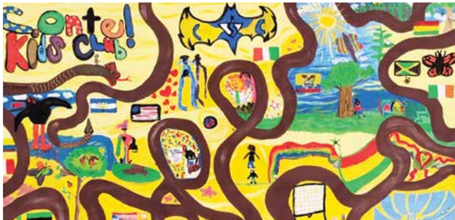
The Conte Kids Club students collaborated to create a mural that weaves their diverse backgrounds, cultures, and experiences into community art that all can enjoy. The mural is located at Durant Park in Pittsfield.

159 children are enrolled in our early education and out-of-school programs across five sites.