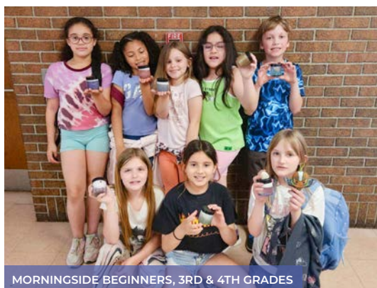
MORNINGSIDE BEGINNERS, 3RD & 4TH GRADES

Our beginners have come so far as new musicians this year. We're excited to see what they will accomplish next year as their Kids 4 Harmony journey continues!